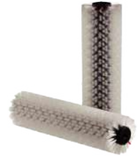
White/ Extra Soft

Residential synthetic fiber cut pile or commercial wool loop pile carpets with diamond sanded tips and wear indicator.