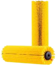
Yellow/ Extra Stiff

Severely matted low loop pile carpets commercial only, with wear indicator. Not for regular use. For "one-time" restorative cleans. Best for extremely matted commercial grade low loop pile carpets.